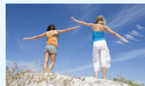
Beach Outing for Girls