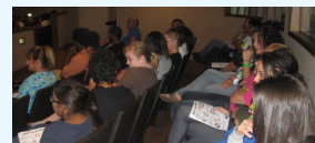
Teens at MADD Meeting