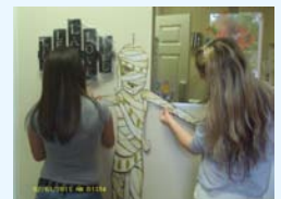
Decorating for Halloween

Weekly Attendance at the Fitness Center Halloween Decorations Hunted House at Birch State Park Pumpkin Picking Pumpkin Carving Pumpkin Seed Bake Face Painting Zombie Dancing Trick or Treating Water Park Tai Chi Bar-B-Q